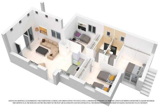
ESTE PLANO ARTÍSTICO, LAS SUPERFICIES Y TRATAMIENTO DE LA PÁRCELA SON ORIENTATIVOS Y NO VINCULANTES. LA PROMOTORA SE RESERVA EL DERECHO A EFECTUAR MODIFICACIONES POR CUALQUIER NECESIDAD THIS ARTISTIC PLAN, THE SURFACES AND THE TREATMENT OF THE PLOT ARE ILLUSTRATIVE AND NON-CONTRACTUAL. THE PROMOTER RESERVES THE RIGHT OF MAKING CHANGES DUE TO ANY NECESSITY