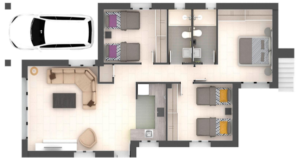
ESTE PLANO ARTÍSTICO, LAS SUPERFICIES Y TRATAMIENTO DE LA PÁRCELA SON ORIENTATIVOS Y NO VINCULANTES. LA PROMOTORA SE RESERVA EL DERECHO A EFECTUAR MODIFICACIONES POR CUALQUIER NECESIDAD THIS ARTISTIC PLAN, THE SURFACES AND THE TREATMENT OF THE PLOT ARE ILLUSTRATIVE AND NON-CONTRACTUAL. THE PROMOTER RESERVES THE RIGHT OF MAKING CHANGES DUE TO ANY NECESSITY